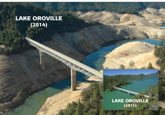
LAKE OROVILLE (2014)